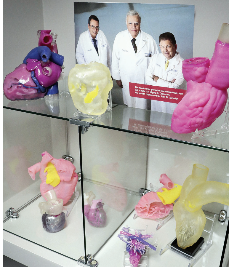
Medical models on display at Houston Methodist DeBakey Heart and Vascular Center

By moving to PolyJet™ technology, 3D Print Bureau of Texas can 3D print outer layers of heart models in a clear material and arteries in color for much greater clarity. The service bureau also prints materials of different hardnesses for a realistic feel that is suitable for physical testing.