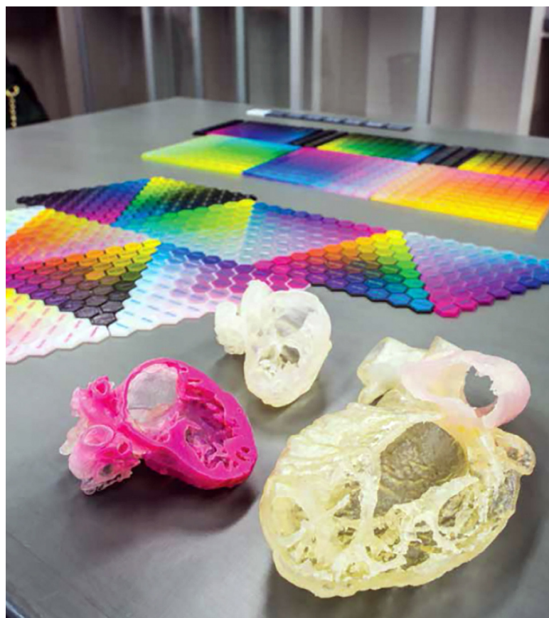
A key advantage of PolyJet is its ability to produce models in multiple colors and materials.

3D Print Bureau of Texas also worked with Houston Methodist DeBakey Heart and Vascular Center on a complex case involving a young patient born with a wide-open leaking pulmonary valve. The patient could not take blood transfusions and had been turned down by two medical centers concerned she would not make it through surgery.