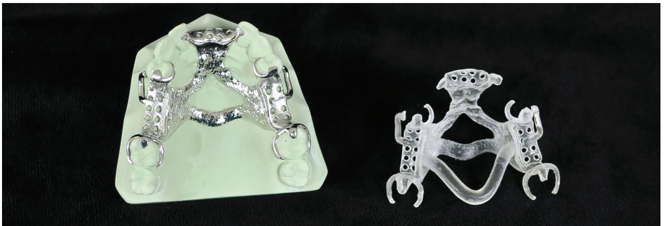
This cast frames, left, was created with the help of 3D printed biocompatible (MED610) material, right.

Among the many benefits of the digital manufacturing processes, the greatest benefit is an estimated reduction of at least 50 percent in labor and time costs. The steps listed above, that traditionally required the attention of a skilled technician working for multiple hours, can now be reduced to minutes with the same level of expertise derived from the same technician.