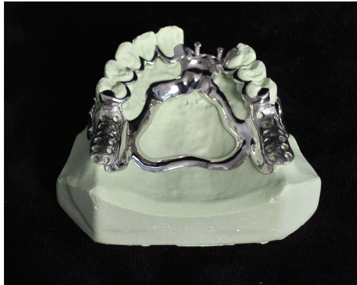
Partial frames, like these two maxillary (upper) arches, can be time- and labor-intensive if created via traditional manufacturing. Digital dentistry improves the time to make and accuracy of partial frames.