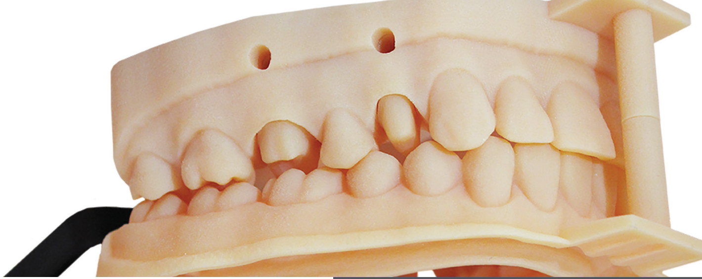
A 3D printed dental model created in MED620™ material.