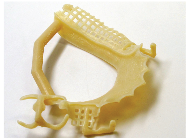
A removable partial framework model 3D printed in MED620 material.