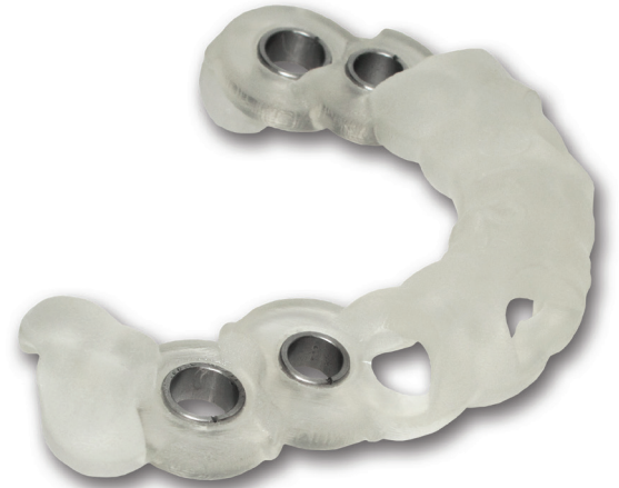
A 3D printed surgical guide used for precise location of dental implants in MED610 material.