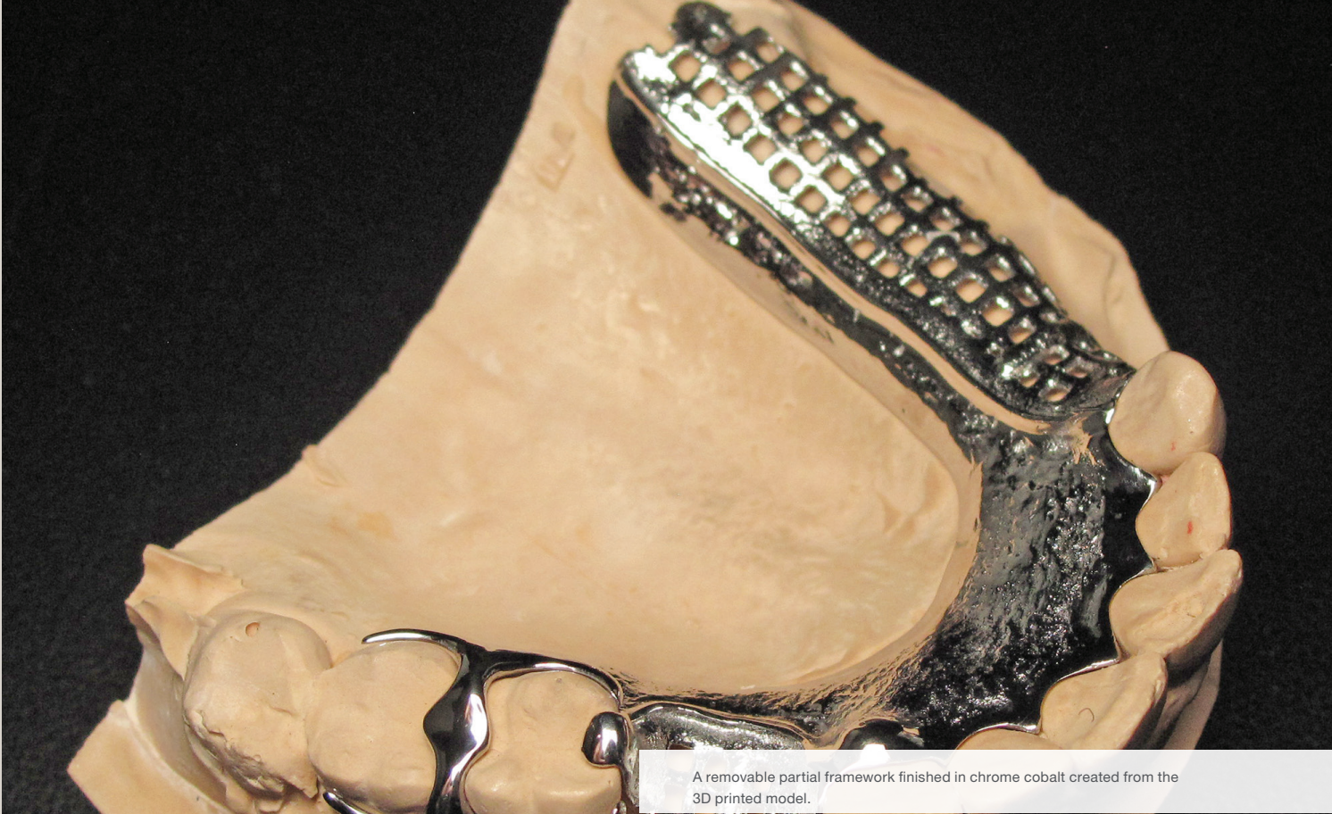
A removable partial framework finished in chrome cobalt created from the 3D printed model.